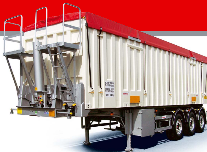
Bolted aluminium walkway

The BULKBOX offers an optimal use: priorities are given to safety, robustness and equipment variety.